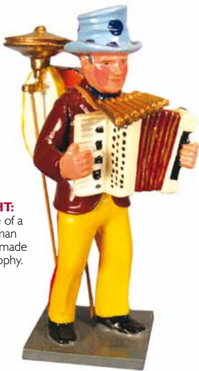
RIGHT: Figure of a one-man band made by Trophy.