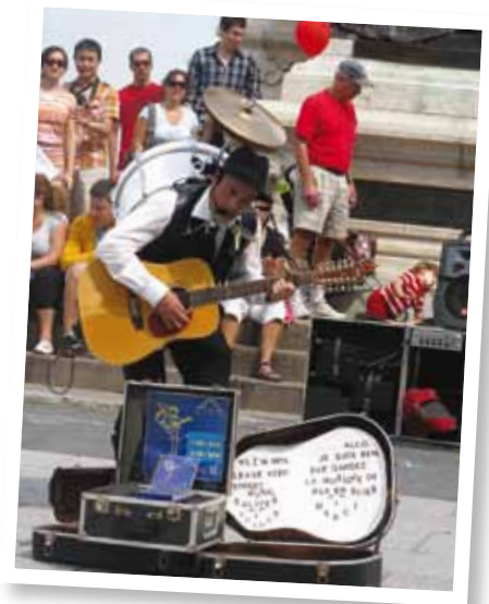
ABOVE: A one-man band performs for tourists in Québec City.

Performers like these have inspired the creativity of painted metal figure makers of days gone by. Examples of one-man bands in my collection were produced by Trophy Miniatures of Wales, Imperial Productions