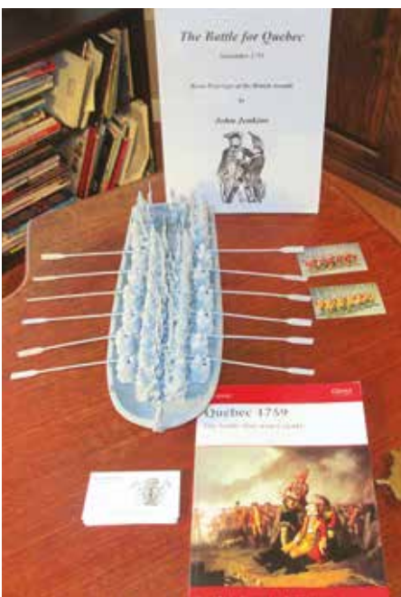
Prototype of a British landing barge from the Battle of Quebec by John Jenkins Designs.