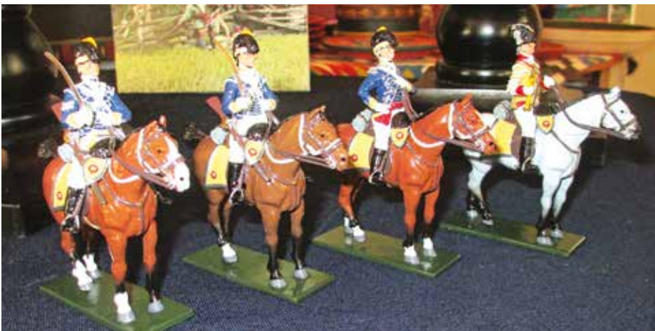
W. Britain prototypes/master figures painted in gloss portraying circa 1795 British Army 10th Light Dragoons.