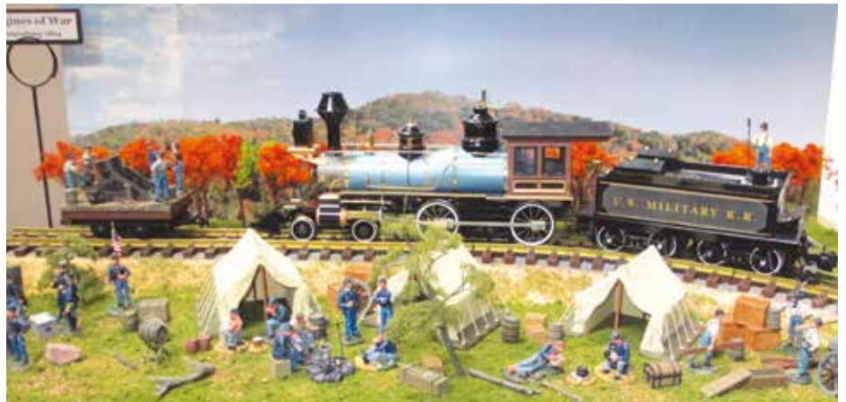
New ACW Union railway diorama titled "Engines of War, Petersburg 1864."