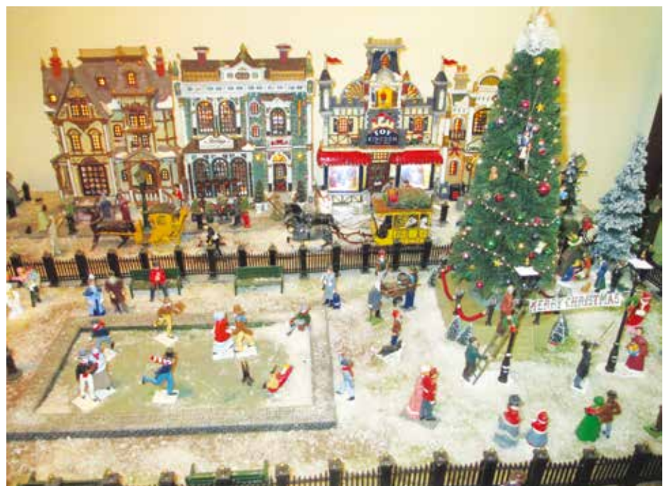
Victorian England Christmas display, complete with the Toy Kingdom shop.