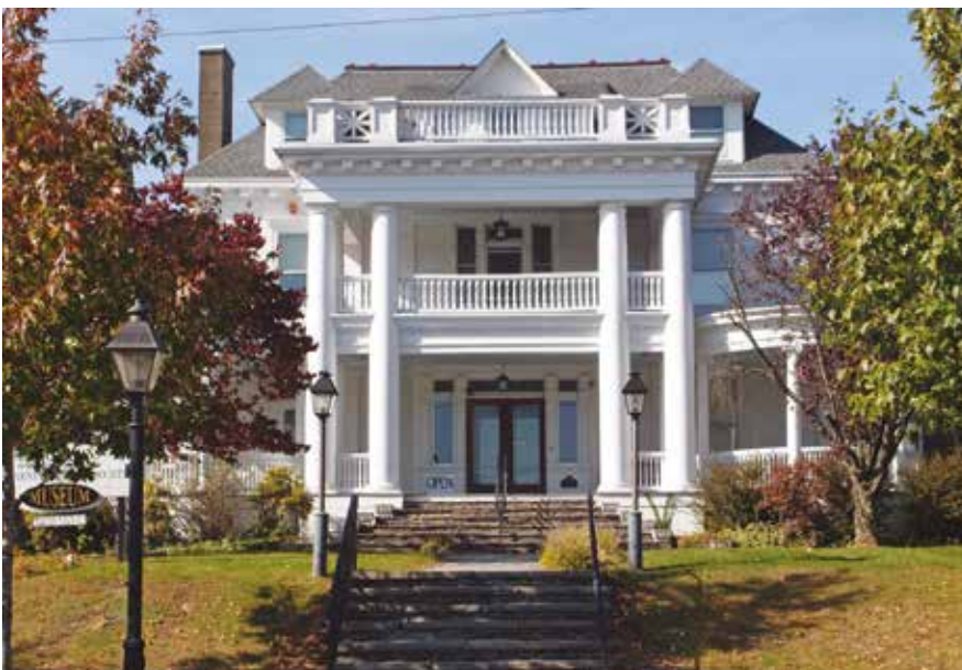
ACW dioramas animated by W. Britain toy soldiers are now housed in The Columns, a mansion museum in Milford, Pa.