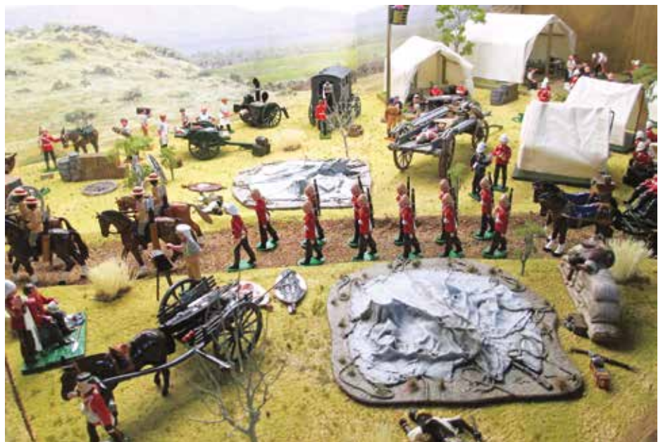
New Zulu War diorama depicting Lord Chelmsford's return to the scene of the Battle of Isandlwana in January 1879.

With The Toy Soldier business and Jim's personal collection rapidly outgrowing the Hillestad residence, the couple decided to go house