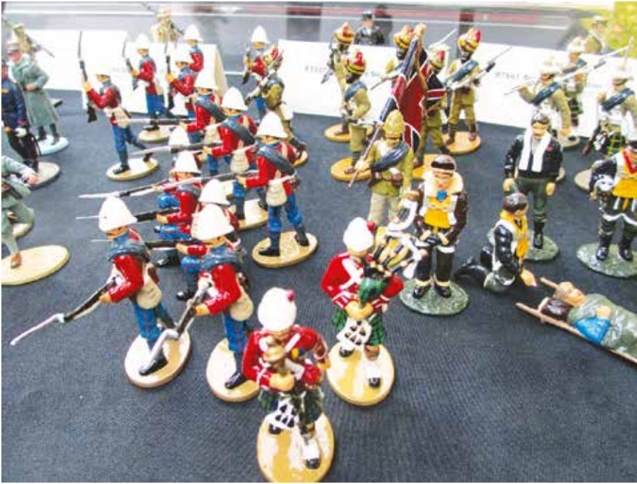
Examples of Frontline Figures garrison part of Richard Walker's table in the garden.