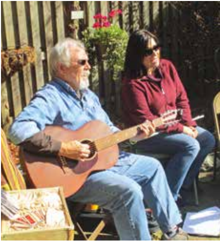
A couple of The Wayfarers perform in garden.

hunting. They found a suitable eight-acre property with a nice house that didn't need a lot of work and moved to Cresco in Northeastern Pennsylvania.