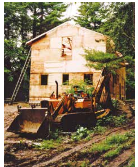
The two-story museum begins to take shape in the Pocono Mountains.