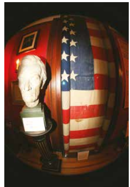
The "Lincoln Flag" is the jewel of the Pike County Historical Society's collection.