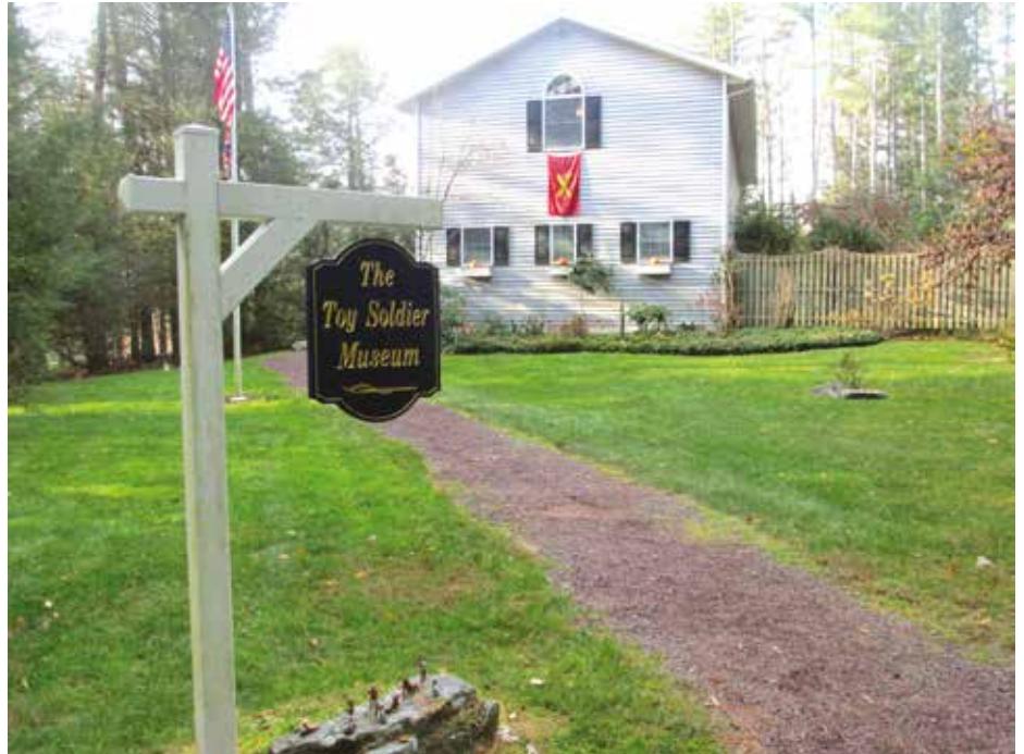
Note how American Dimestore toy soldiers do battle around the base of the museum's sign on Halloween 2015.