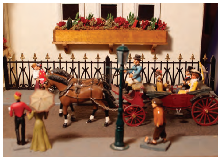
Club members and their ladies arrive for the holiday festivities.