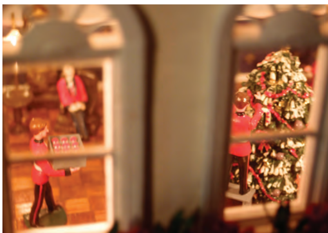
Ornaments are brought out as the Christmas tree is decorated.