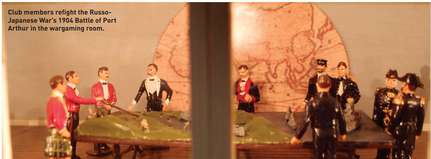
Club members refight the Russo-Japanese War's 1904 Battle of Port Arthur in the wargaming room.

The diorama contains four chandeliers, many floor lamps, two fireplaces, an interior staircase and colorful window boxes of holiday greenery. There are three floors showcasing five decorated rooms and a below-street level kitchen.