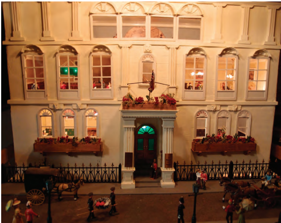
Facade of the miniature Army & Navy Club.