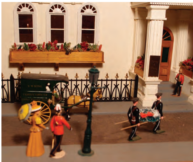
A Christmas wreath is brought to the club.

My replica of the Club building is 30 inches wide by 24 inches deep (including a roadway) and 27 inches high. It was custom-made for me by the late, very talented G. Huntley-Williams of Windows of the World.