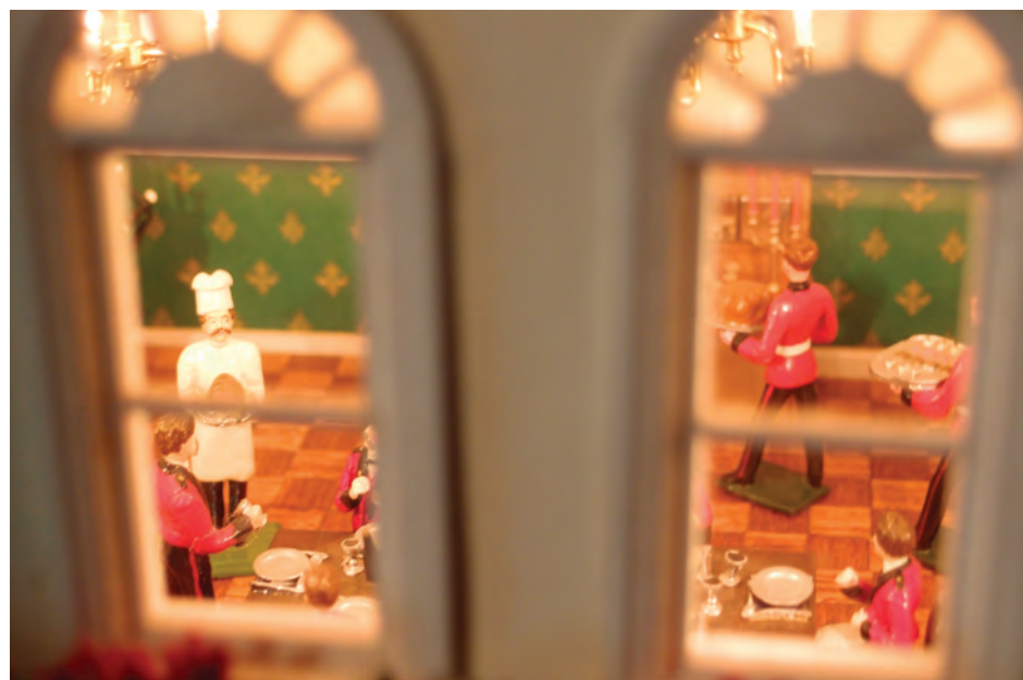
Dinner is served to Club members and their guests.