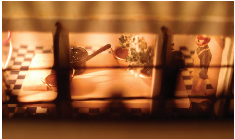
A chef prepares the meal.

The Club was founded by Lt. Gen. Sir Edward Barnes in 1837, the year Queen Victoria acceded to the throne.