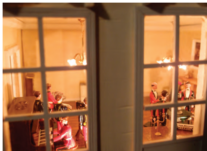
Party-goers sing Christmas carols and enjoy glasses of punch.