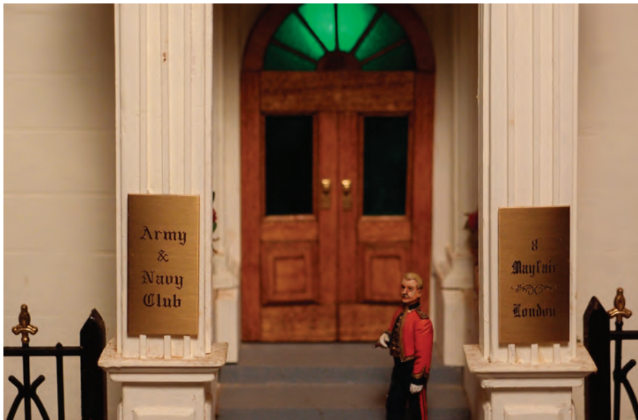
Entrance to the Club.

Arthur Wellesley, Duke of Wellington, was its first president.