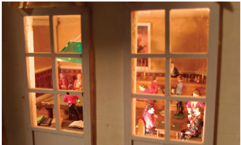
Officers enjoy playing billiards or whist and drinking whiskey.